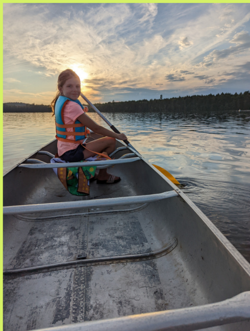
She & Me at Lake Clear Camp