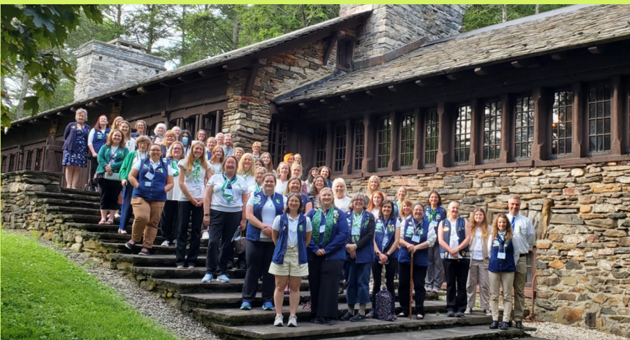
GSNENY Delegates at Edith Macy Conference Center for the Strategic Planning Retreat