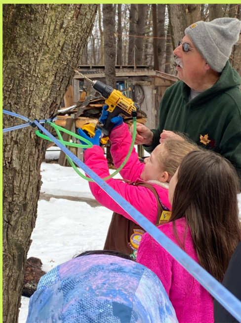
Girls learned how to tap trees for maple syrup.