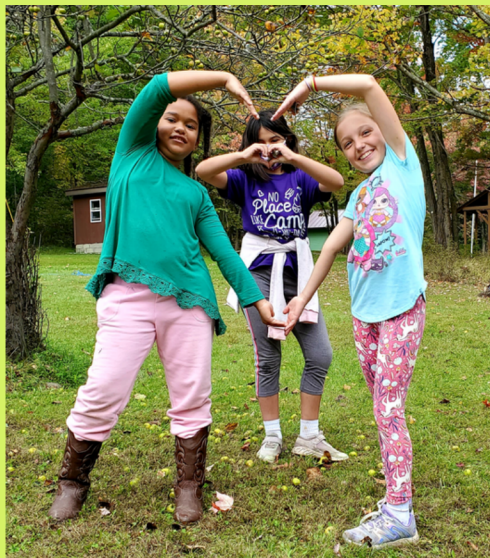
Girls loved the return of overnight camp programs at Hidden Lake Camp and Lake Clear Camp in 2022!