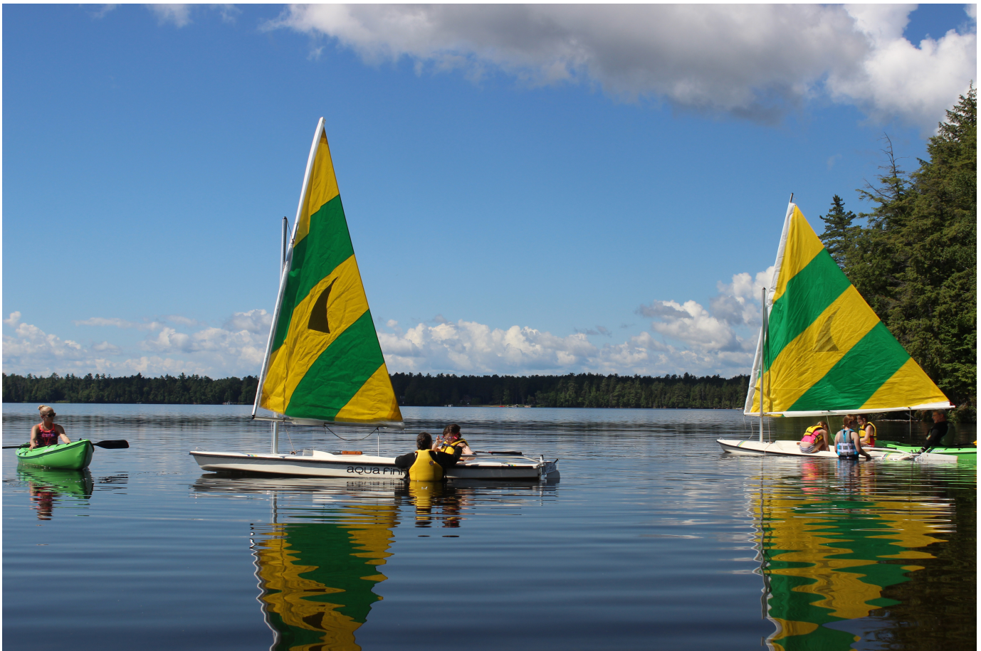
Lake Clear's Mariner Program

Do Not return to the camp until the okay is given by the firefighters (or the person in charge of the drill). When you return, shut off the fire alarm if it is still sounding.