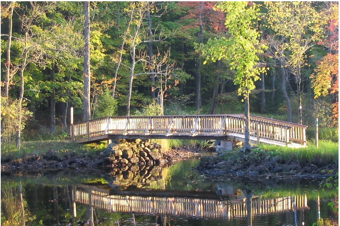
Footbridge at Camp Woodhaven

Do Not return to the camp until the okay is given by the firefighters (or person in charge of the drill). When you return, shut off the fire alarm if it is still sounding.