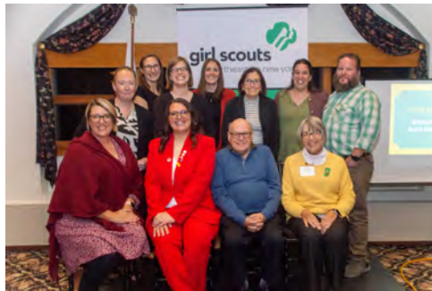
Volunteers from Service Unit 425