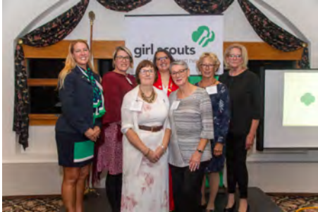
Former Honorees Women of Distinction