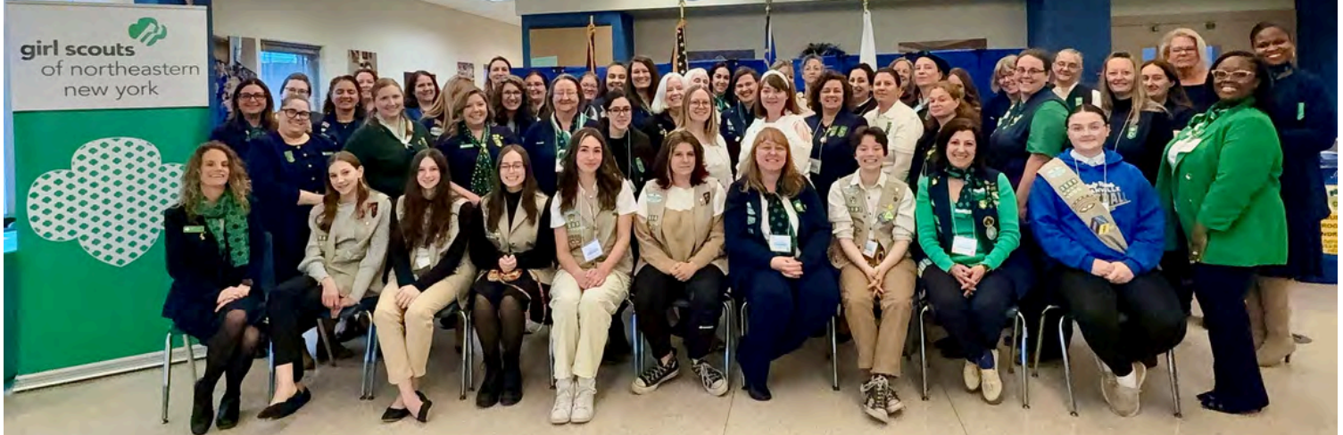
Photo of Service Unit Delegates and Alternates, Board Members, Nominating and Board Development Committee Members, and GSNENY staff who were at the Strategic Planning Retreat, March 29, 2025

Please help us congratulate the following who were elected!