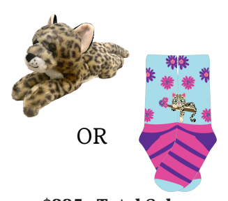
$325+ Total Sales Choice of: Small Ocelot Plush OR Ocelot Socks