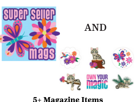
5+ Magazine Items Super Seller Mags Patch & Theme Stickers