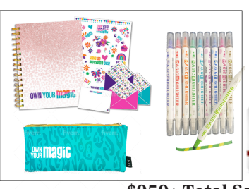
$950+ Total Sales Choice of: Zipper Pouch & Stationery Set & Color Changing Markers OR $25 Online Store Gift Card