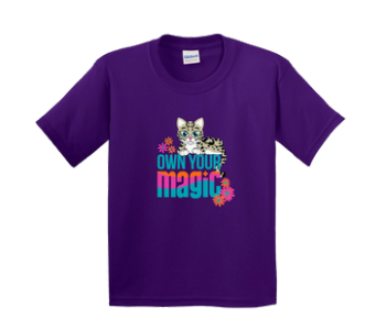
$575+ Total Sales Own Your Magic T-Shirt